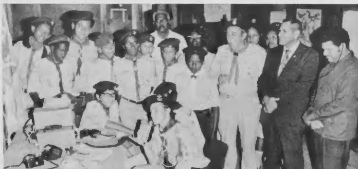
Greeting friends abroad. Saludando amigos na exterior.